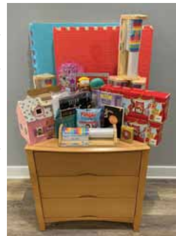
Thanks to all of you who have already started to fulfill our Wishlist requests!