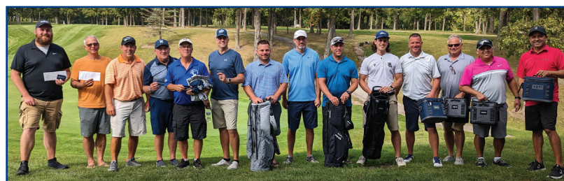
Pictured are winner's from this year's scramble, 1st Children's Lantern, 2nd Boyer's Construction, 3rd Sauder Woodworking

With the support from several sponsors and donations, over $18,000 was raised at this year's scramble! It truly takes a community to make a difference, and we are grateful to those that came together this year to make an impact in a child's life!